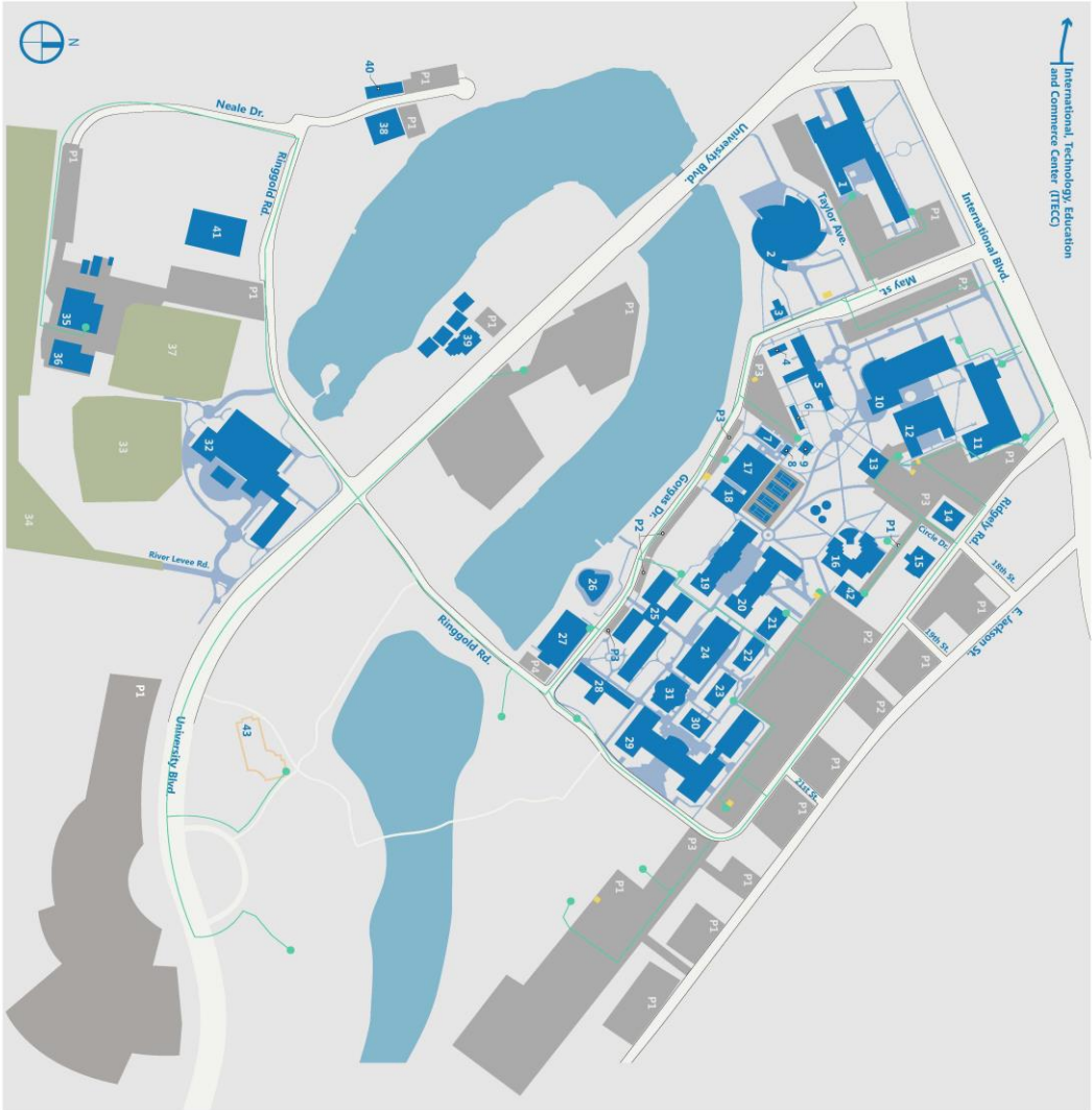
Exhibit G Campus Map