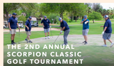
August 27, 2022