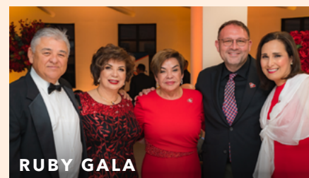
April 2, 2022