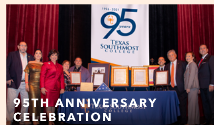
October 30, 2021