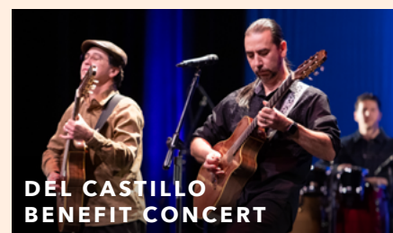
February 12, 2022